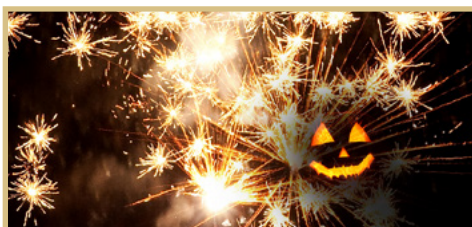
Halloween Fireworks and Bonfire Event. Saturday 29th October. From 5pm. Tickets available from reception and online from mid-September.

Visit www.haughtonhall.com for full details