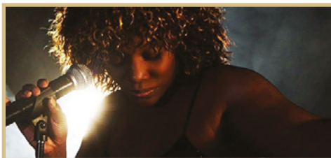
Tina Turner Tribute. Wednesday 14th December. From 7pm.