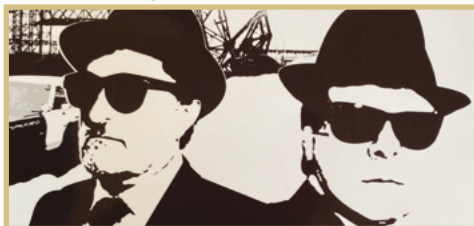
Blues Brothers Tribute. Wednesday 7th December. From 7pm.