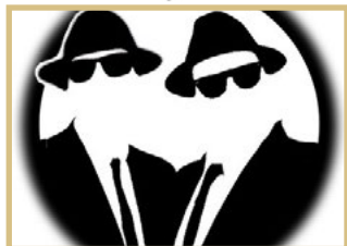
Blues Brothers Tribute. Thursday 2nd December. From 7pm.