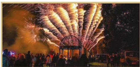
Halloween Fireworks and Bonfire Event. Saturday 30th October. From 5pm. Tickets available from reception and online in July.

Visit www.haughtonhall.com for full details