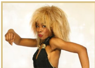
Tina Turner Tribute. Wednesday 8th December. From 7pm.